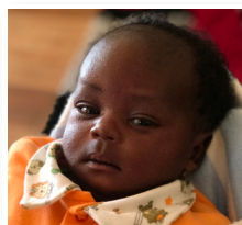
Baby Brave Born: January 11, 2020 Weight: 2.5 kg

Thanks to Wills & Trusts in United Kingdom, Seeds Program International and Rachel Phillips for providing us with 5 000 packages of seeds, we were able to bring 700 packages to distribute to the local people. We had five different types, carrots, cabbage, spinach, tomatoe and raddish. We distributed to people in Masaai land, Kenswed Academy's kitchen garden and other local people with irrigation systems. The seeds will be able to provide these households with income and great produce for themselves.